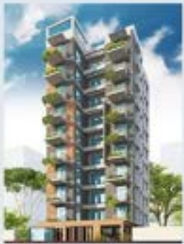
ANZ-Aftabnagar 5 katha at Aftabnagar