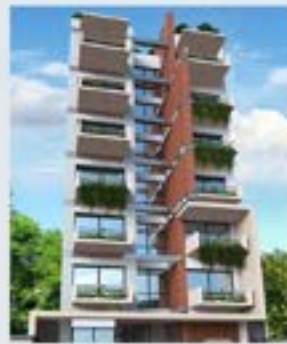
ANZ-Aftabnagar 3 katha at Aftabnagar