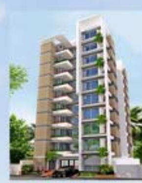
ANZ - Paradise at Bashundhara