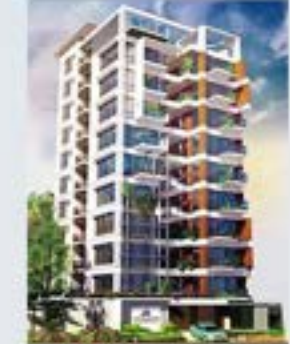
ANZ-South face at Bashundhara