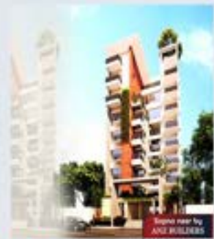
ANZ - Sopno Neer at Bashundhara Baridhara