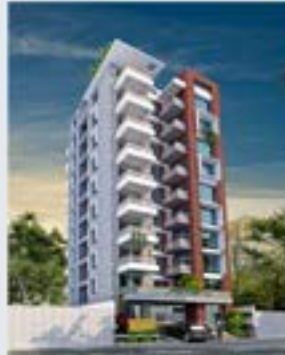
ANZ-Riverview at Bashundhara