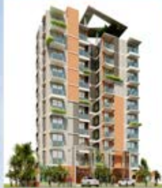
ANZ - Shouhardo at Bashundhara