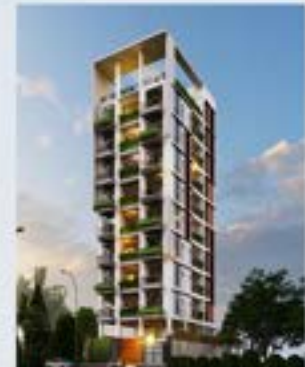
ANZ-Orchid Villa at Jolshiri