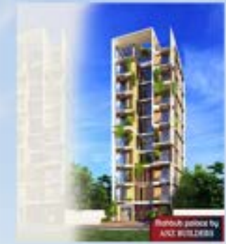
ANZ - Mahbub Palace at Bashundhara Riverview