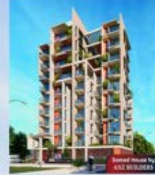
ANZ - Samad House at Bashundhara Riverview