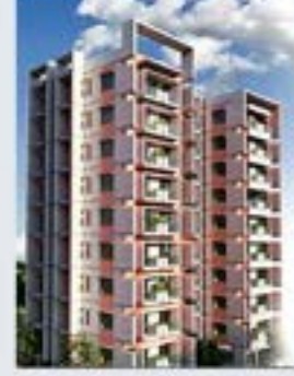
ANZ- Lake View at Bashundhara