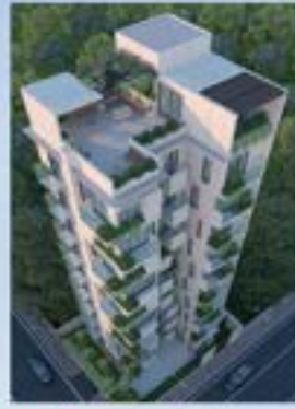
ANZ-Amity Villa at Bashundhara