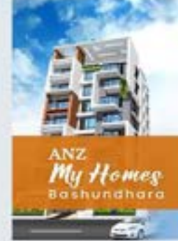
ANZ-My Home at Basundhara