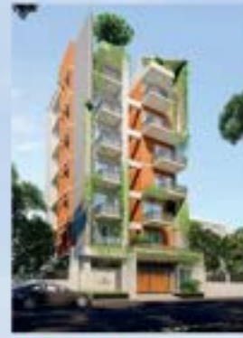
ANZ - Cherry Blossom at Bashundhara