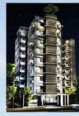
ANZ-Luxury Palace at Bashundhara