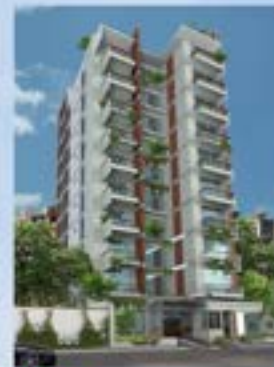
ANZ - Southern Park at Bashundhara