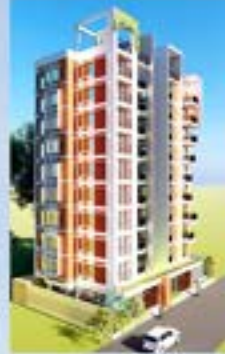
ANZ-Engineers Lodge at Bashundhara