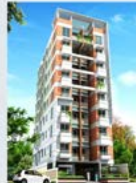
ANZ- Lake Park View at Bashundhara