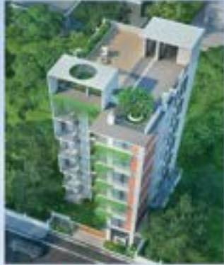
ANZ - Florence Villa at Bashundhara